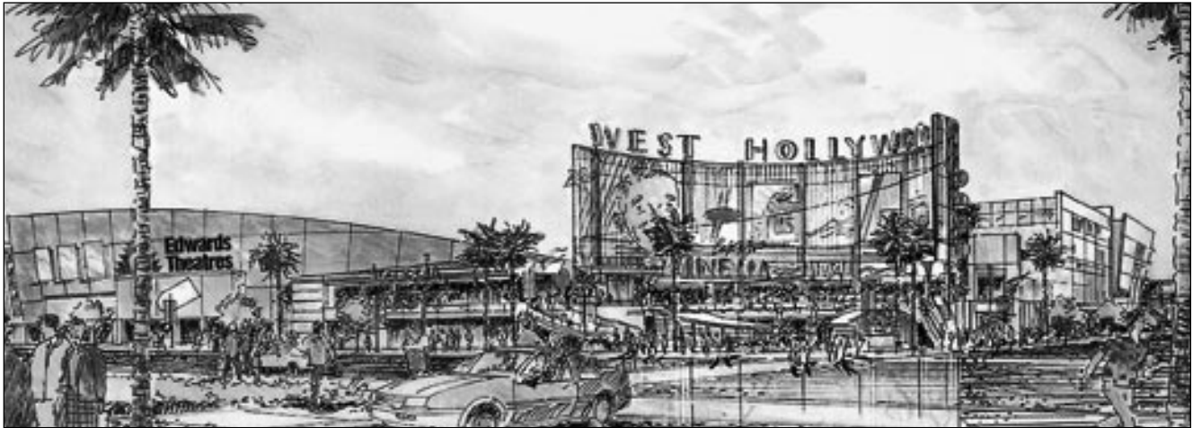
West Hollywood Gateway, J.H. Snyder Co.

In Southern California, entertainment is a prerequisite to retail development these days. Here is an overview of some projects recently constructed and currently proposed.